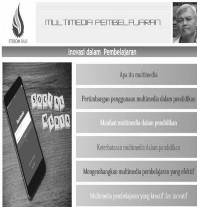
Figure 1a: Screen capture of Laptop/PC