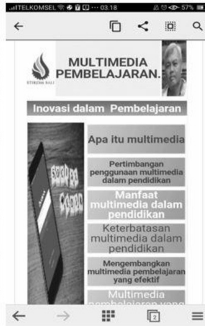
Figure 1b: Screen capture of mobile phone